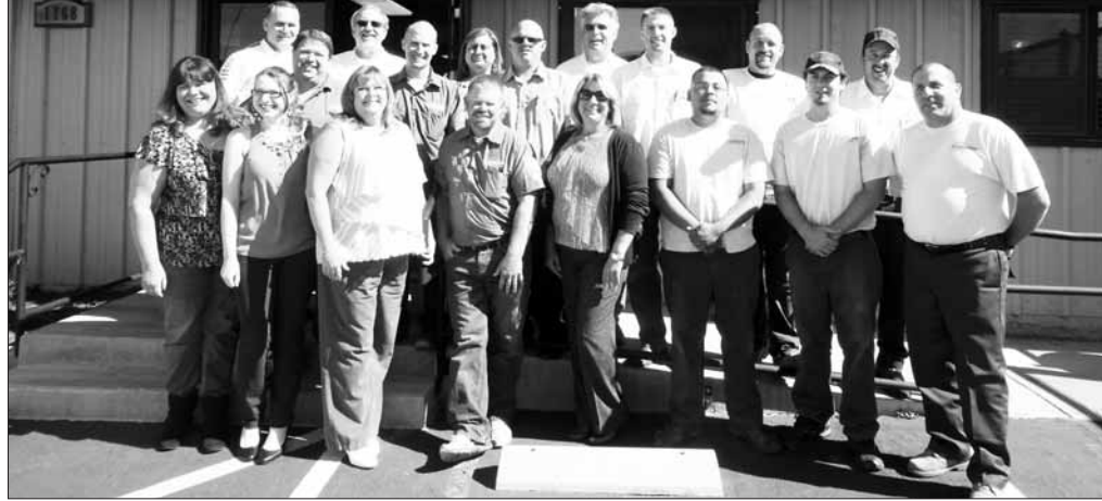
A-1 Guaranteed team.